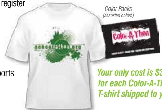
Color Packs (assorted colors)

Your only cost is $3.00 for each Color-A-Thon T-shirt shipped to you.