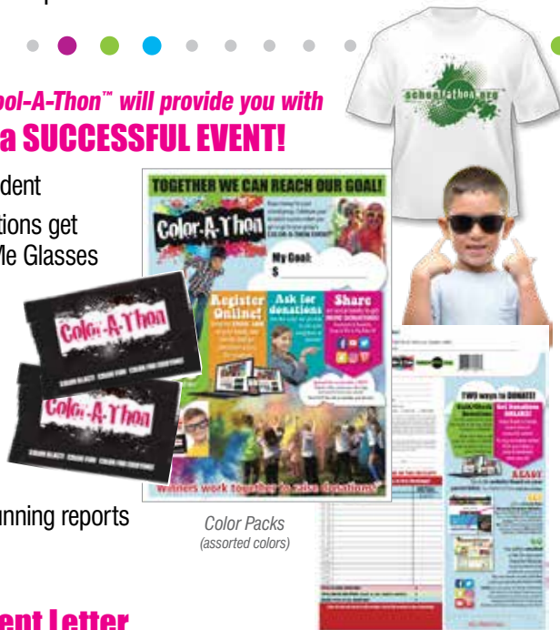
Color Packs (assorted colors)